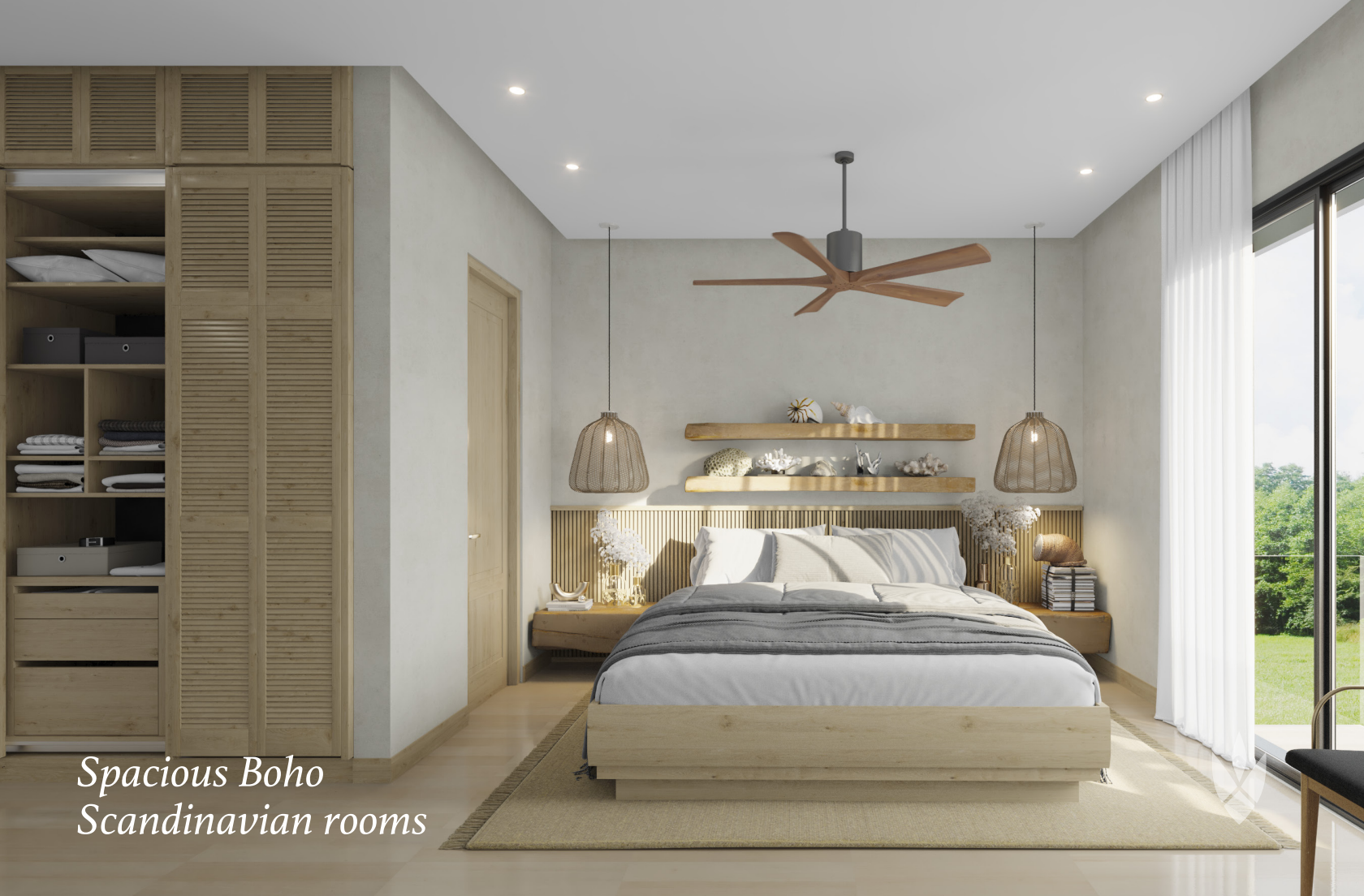
Spacious Boho Scandinavian rooms